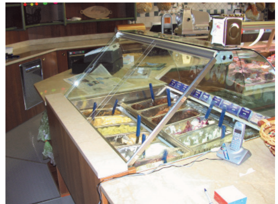
Selling Room: Ice Cream