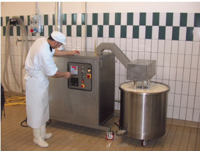
Polyfood at work