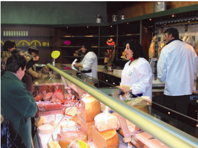
Selling Room: Cheeses & Salami