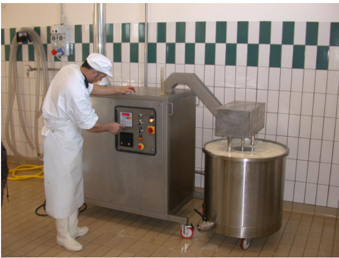
Polyfood at work