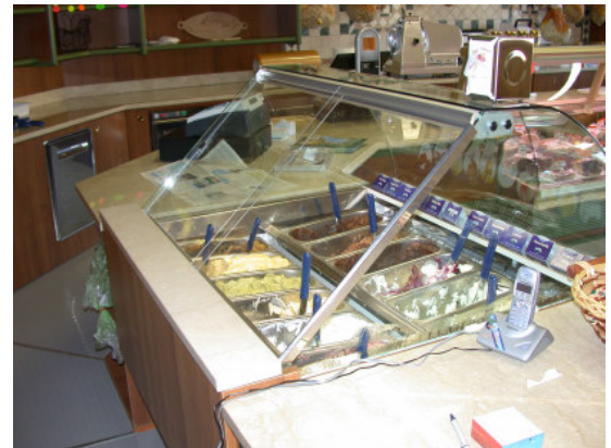
Selling Room: Ice Cream