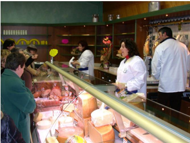
Selling Room: Cheeses & Salami